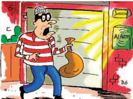
Burglar alarms and lights will deter thieves

your front and back doors and keep them locked at all times – even when you are at home.