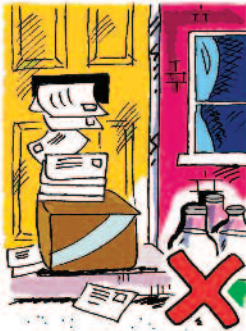
Make sure your home looks occupied while you are away