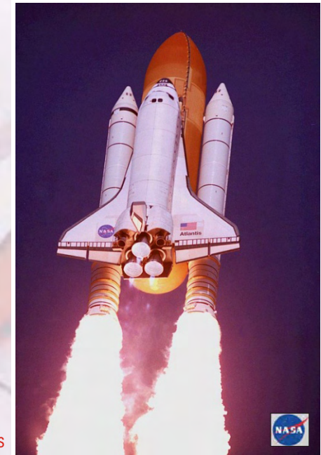
Space Shuttle Atlantis

Cryosurgery is the use of extreme cold to treat cancer. For external tumours, liquid nitrogen (at -196^\circ\text{C} or 77 K) is applied directly to the skin. For internal tumours, liquid nitrogen is circulated through a cryoprobe, which freezes and destroys the cancer cells. This procedure offers the advantage of very quick patient recovery time.