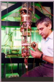
An Oxford Instruments ^3\text{He} - ^4\text{He} dilution refrigerator, and a fish-eye view of it in use at Royal Holloway, University of London

A dilution refrigerator circulates ^3\text{He} , in a mixture of the helium isotopes ^3\text{He} and ^4\text{He} , to reach very low temperatures down to below 2 \times 10^{-3} \text{ K} (2 mK).