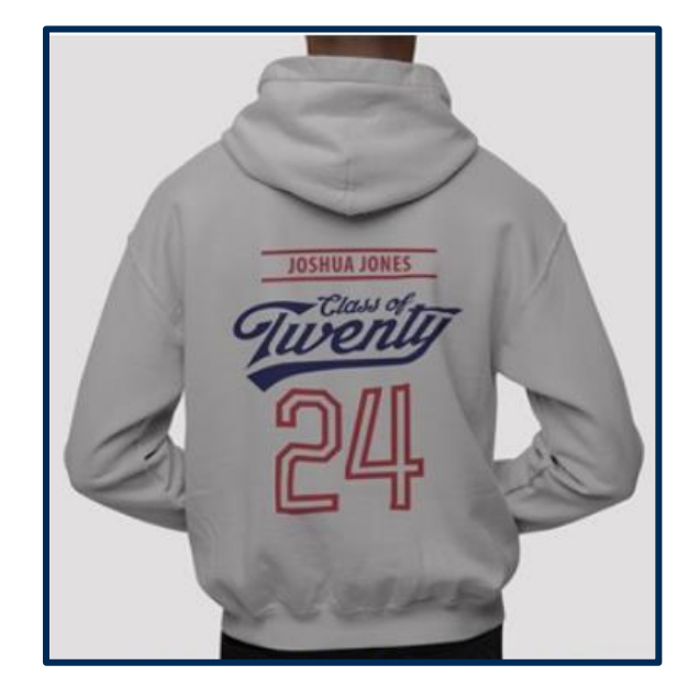
Example Back Print

Highlight Name – one name can be picked out the class list and highlighted in any colour, colour matched to logo. We also make the text slightly larger.