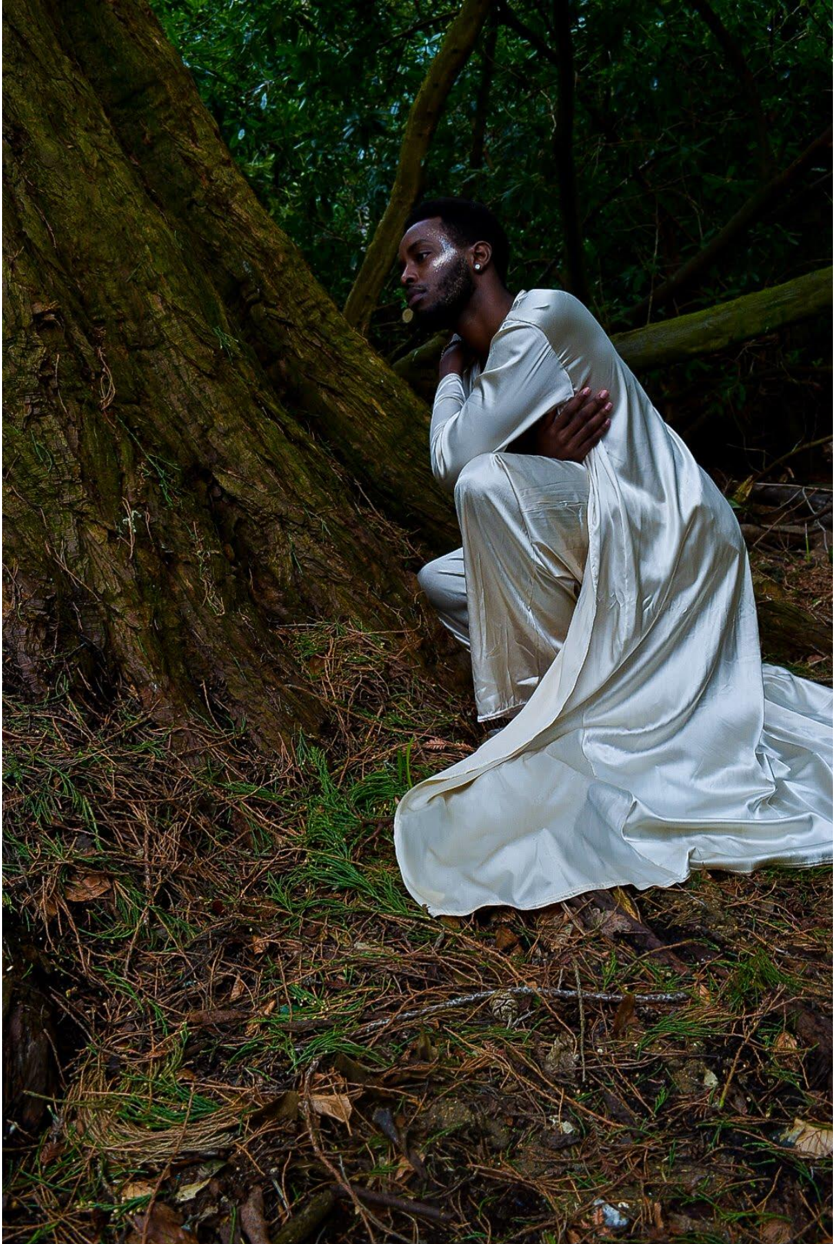
He meditates on his soul and connection with the earth.