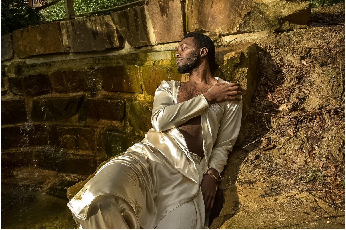
Apollo is being baptised and reenergised in the beams of the sun.