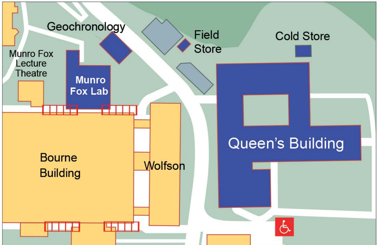
Extract from the main campus plan showing location of Geography Department buildings

The Department occupies modern purpose-built accommodation on the ground floor of the Queen's Building. Here you will find a lecture theatre, teaching rooms, Geography staff offices, 'Library@Geography', and research and teaching laboratories. Additional teaching laboratories are located in the nearby Munro Fox Laboratories. The map below details the location of Geography department buildings, with a further diagram giving details of the location of staff offices within the Queen's Building.