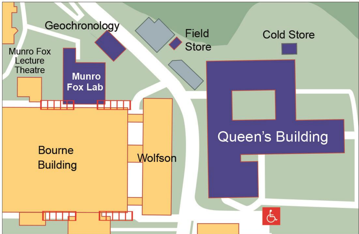
Extract from the main campus plan showing location of Geography Department buildings

The Department occupies modern purpose-built accommodation on the ground floor of the Queen's Building. Here you will find a lecture theatre, teaching rooms, Geography staff offices, 'Library@Geography' (Q174), and research and teaching laboratories. Additional teaching laboratories are located in the nearby Munro Fox Laboratories. The map below details the location of Geography department buildings, with a further diagram giving details of the location of staff offices within the Queen's Building.