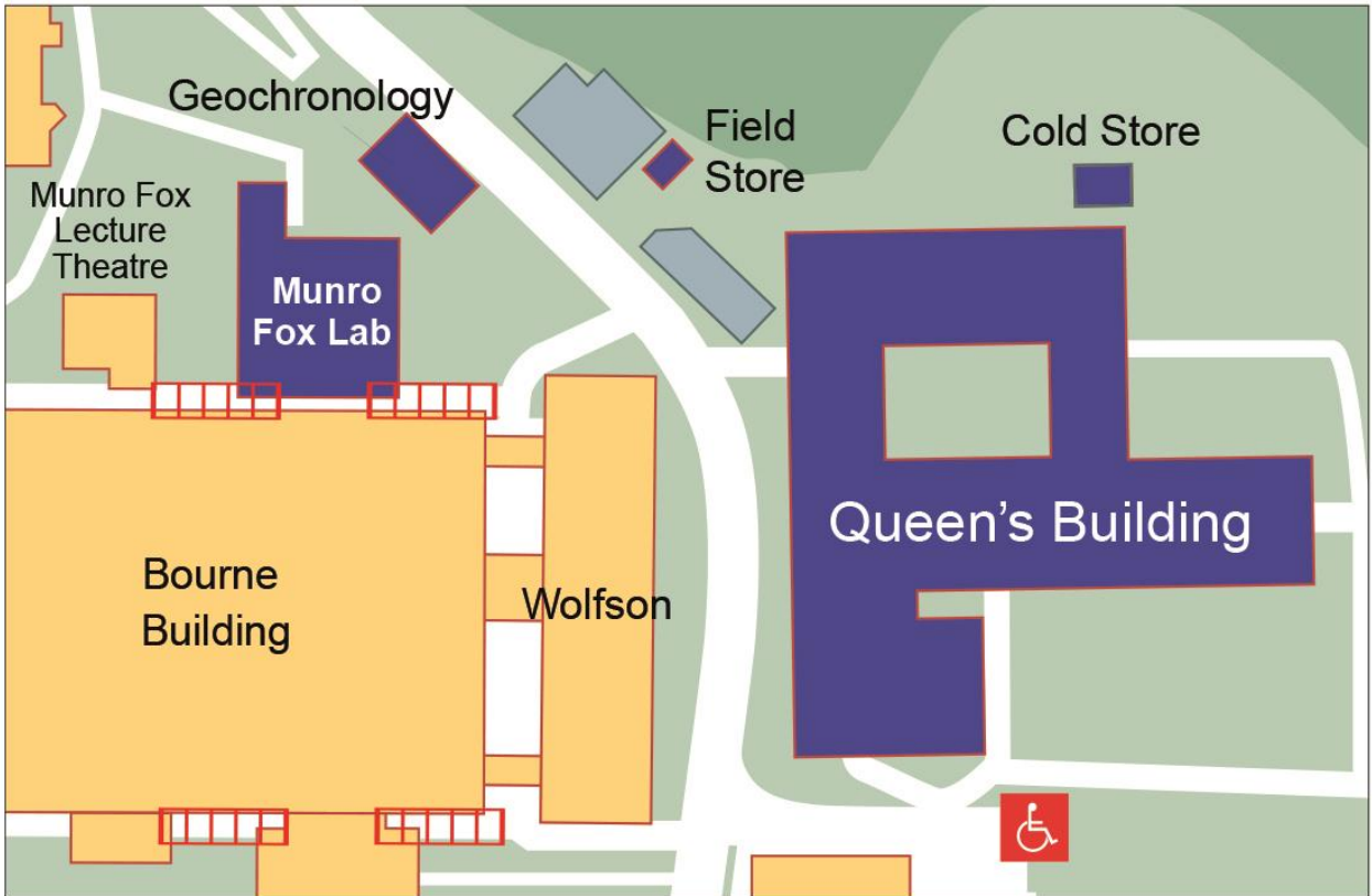
Extract from the main campus plan showing location of Geography Department buildings